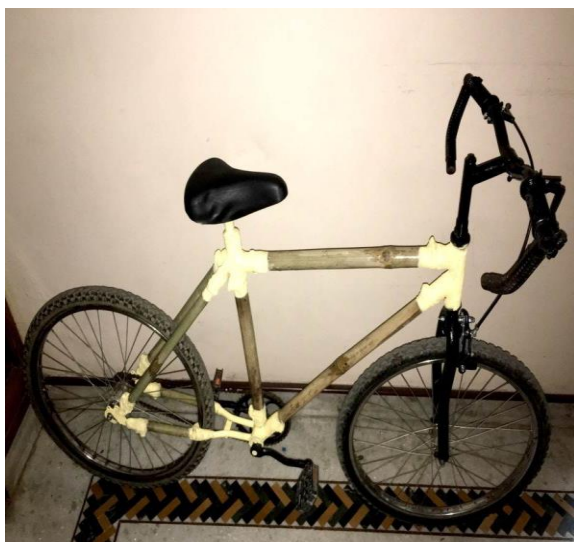
Fig 4: Our Bamboo Bicycle Ready for Riding

After two weeks to fit all the parts and adjusting them for smooth running of the bicycle.