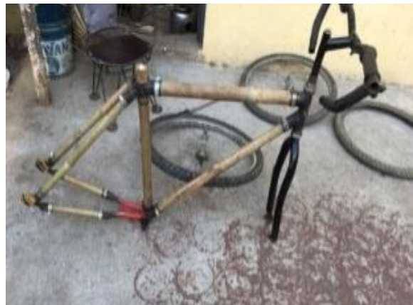
Fig 3(b): After Coating the Joints