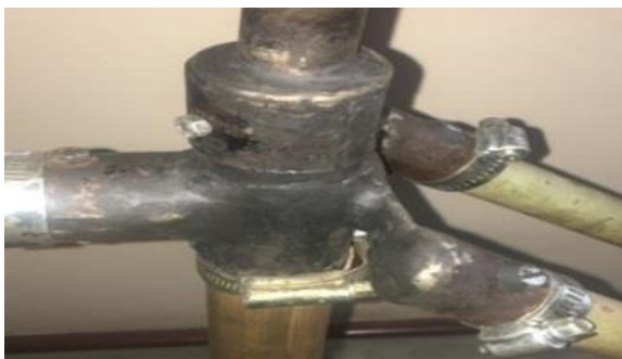
Fig 2: The Bush and Clamp Joining System

The bicycle frame consists of straight bamboo pieces connected to each other via suitable joints. There are many methods to join bamboo pieces with the help of bolts, nuts, ropes, glues, etc. [0]. Some of these techniques tested the joints for strength. Joints having glue (fevicol) and bolt and nuts failed and finally we made a clamp-type joint in which steel pipes were welded to each other and bamboo pieces were clamped in them as shown in figure 2.